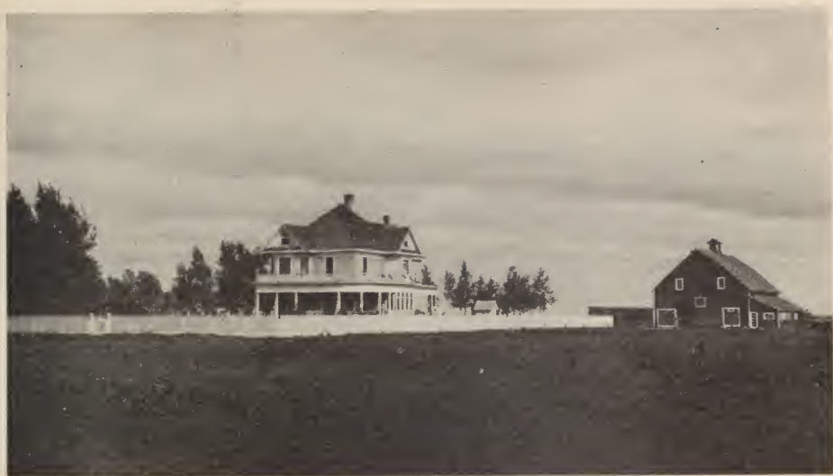
A NOT UNUSUAL TYPE OF FARM-HOUSE AND BARN, NORTH DAKOTA

bears an enviable reputation among the educational institutions of the northwest.